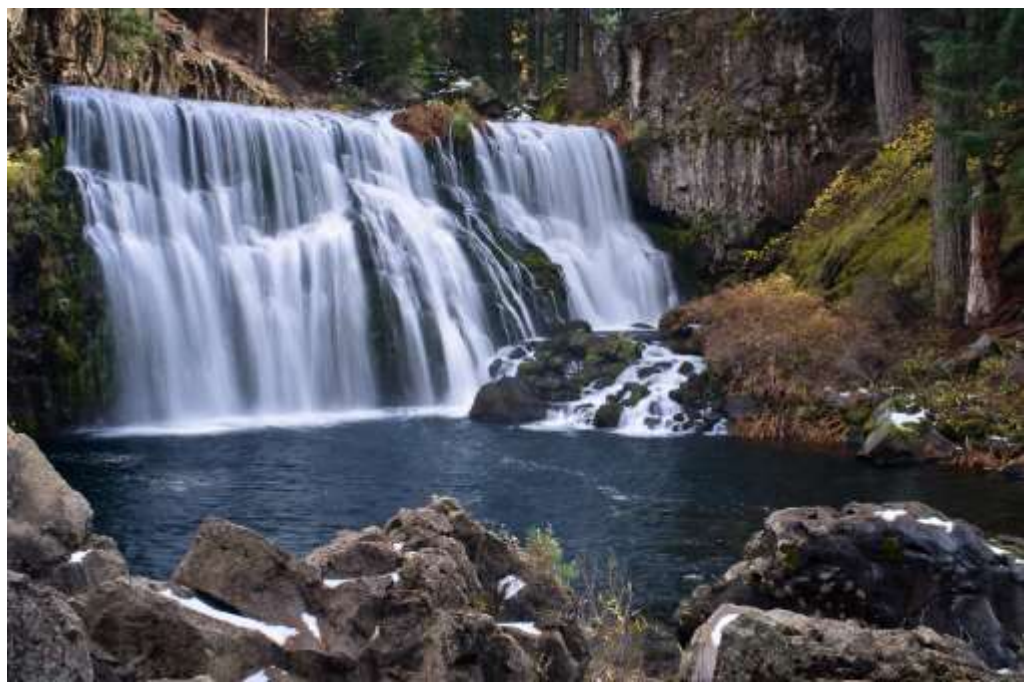
Middle McCloud River Falls

Head west toward Fowler Public Camp Rd (1 mile) Turn right onto Fowler Public Camp Rd (.5 miles) Turn left onto CA-89 N/Volcanic Legacy Scenic Byway (15 miles) Turn right onto S Mt Shasta Blvd