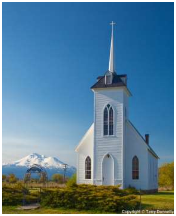
Church in Little Shasta

Turn left onto Big Springs Rd (12.4 miles) Turn right onto Hart Rd (1.7 Miles) [Stop to see Yreka Trail Route] Turn left onto Harry Cash Rd (3.5 miles) Continue onto Lower Little Shasta Rd [Church]