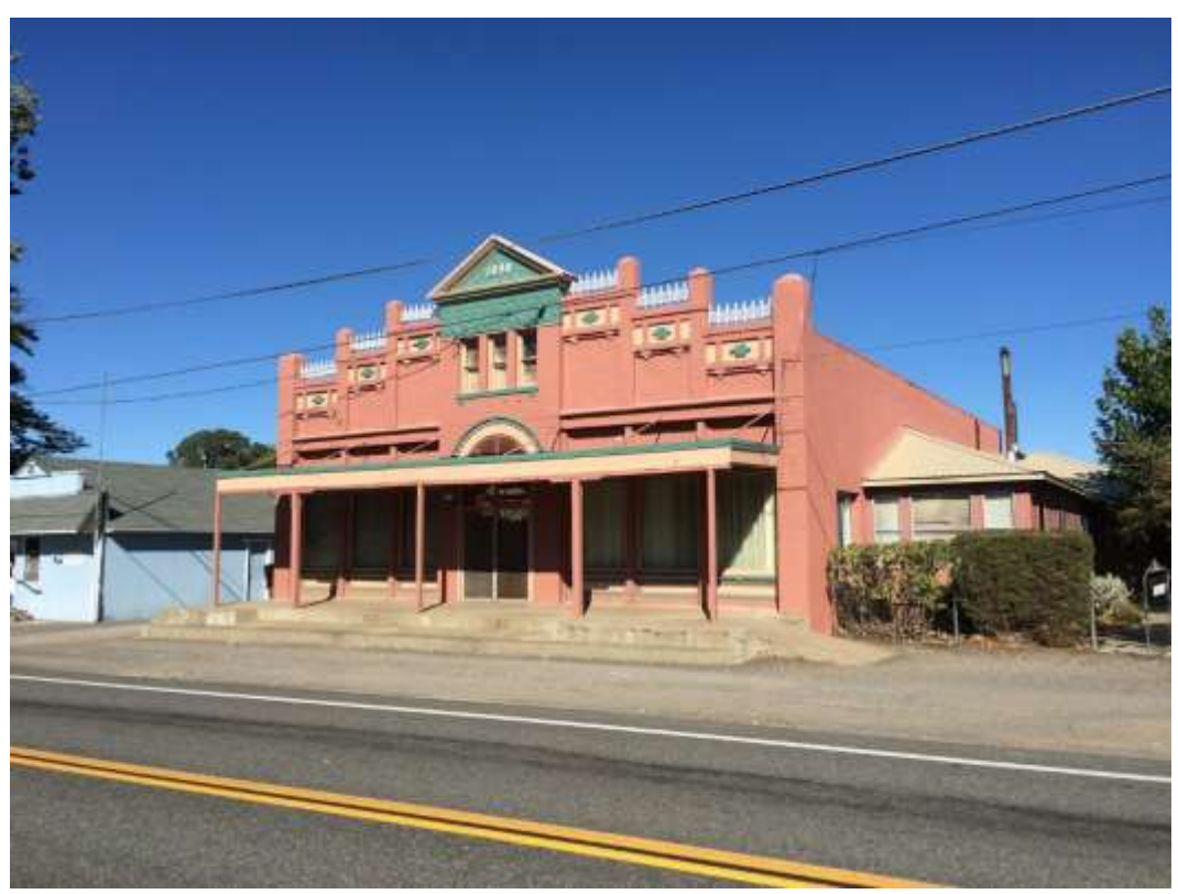
Denny Bar Store in Gazelle

Becomes Easy Street, Old Hwy 99 (23.5 Miles). Stop in Gazelle at Denny Bar Store. Turn right onto N Old Stage Rd (9.5 miles) Turn right to stay on N Old Stage Rd (3 miles) Turn right at Hatchery Ln to Sisson Museum